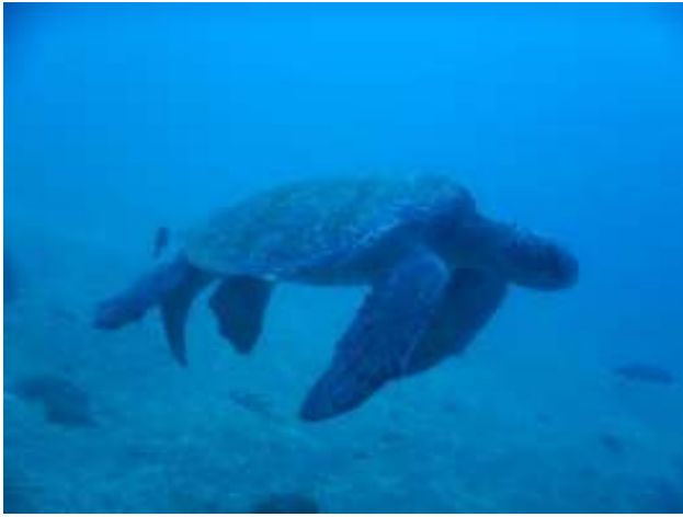
Probably the biggest turtle I've ever seen. This grand ol'dad paid us no mind