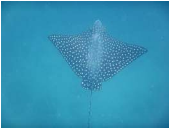
Caught this eagle ray while freediving off the dive boat