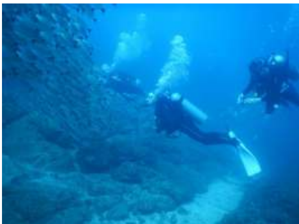
We were enthralled by the large schools of fish

Spots still available, but we may be asked to release the extra rooms soon. If you are considering this trip, now is the time to commit. Air was still around $1200 last time I heard. Cheap trip for two weeks of the best diving you will ever do. Go to the website to check it out. 🚩