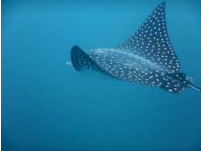
Took a big breath and dropped along side him.