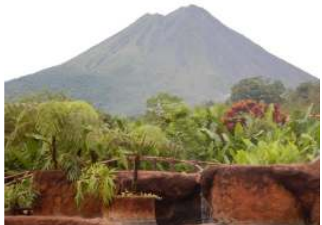
Arenal Volcano from the lodge.