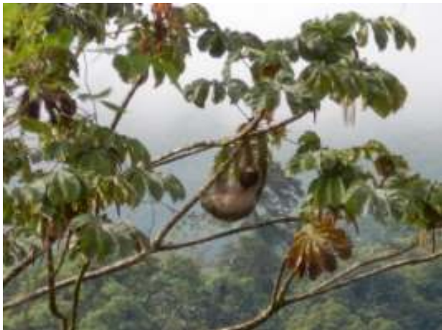
That's a Three Toe Sloth mind you