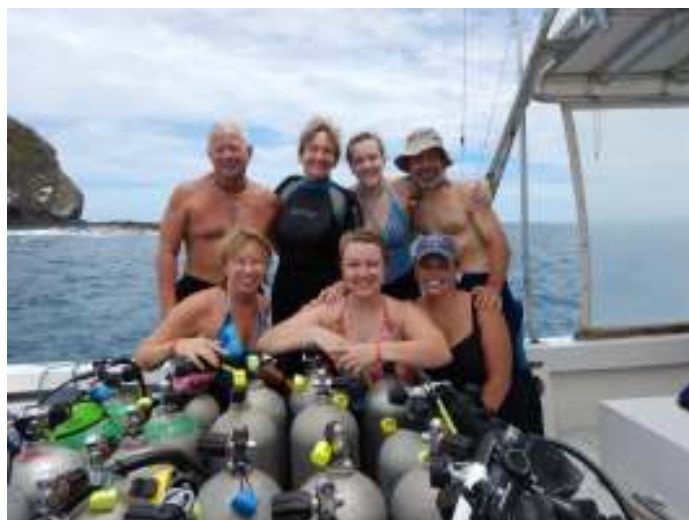
The gang- above and below

The Dale Hollow Lake Dive/Eat/Relax/Play trip is "ON" for Saturday July 18, 2015! Reservation form and trip details are on our webpage. Please note however there are 2 updates not reflected on the trip website: (1) This is a Saturday only trip – no pontoon boat on Sunday and (2) we will not have the cook-out/pot luck on Saturday night – instead will we chow down at the Dale Hollow Lodge Restaurant in air conditioned luxury. Make your reservations now --- overnight accommodations at the campground, cabin or state park! The BGDC subsidizes this trip which reduces the cost to $20.00 per person to be on the pontoon boat. ( mulberryc1@gmail.com ) 🚩