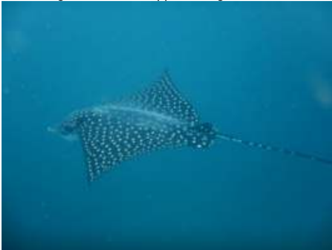
It was a wonderful 10 seconds to swim with such a beautiful creature